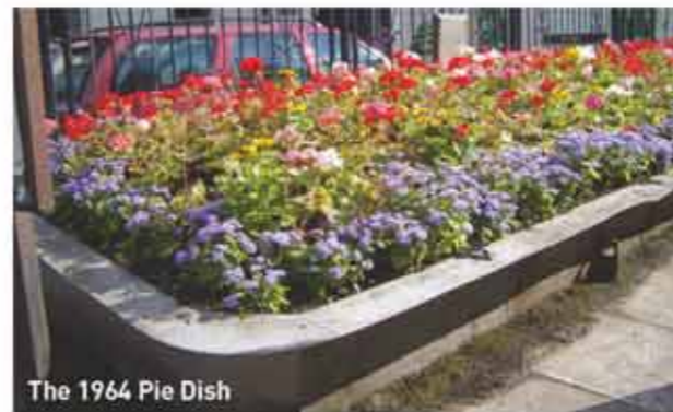
The 1964 Pie Dish

Trains to Denby Dale from Huddersfield, Penistone, Barnsley and Sheffield run hourly Monday to Saturday with 8 trains each way on Sundays.