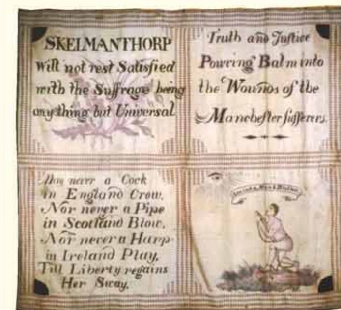
The Skelmanthorpe Chartist Flag

A scenic three-mile walk around the historic village of Skelmanthorpe. Allow a couple of hours for a family stroll. Stout footwear is advisable.