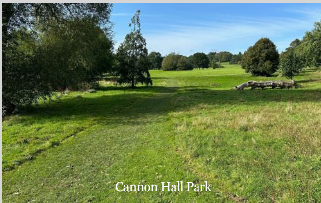
Cannon Hall Park