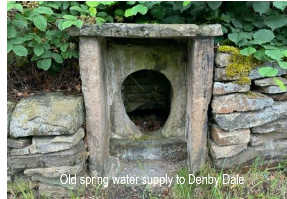
Old spring water supply to Denby Dale