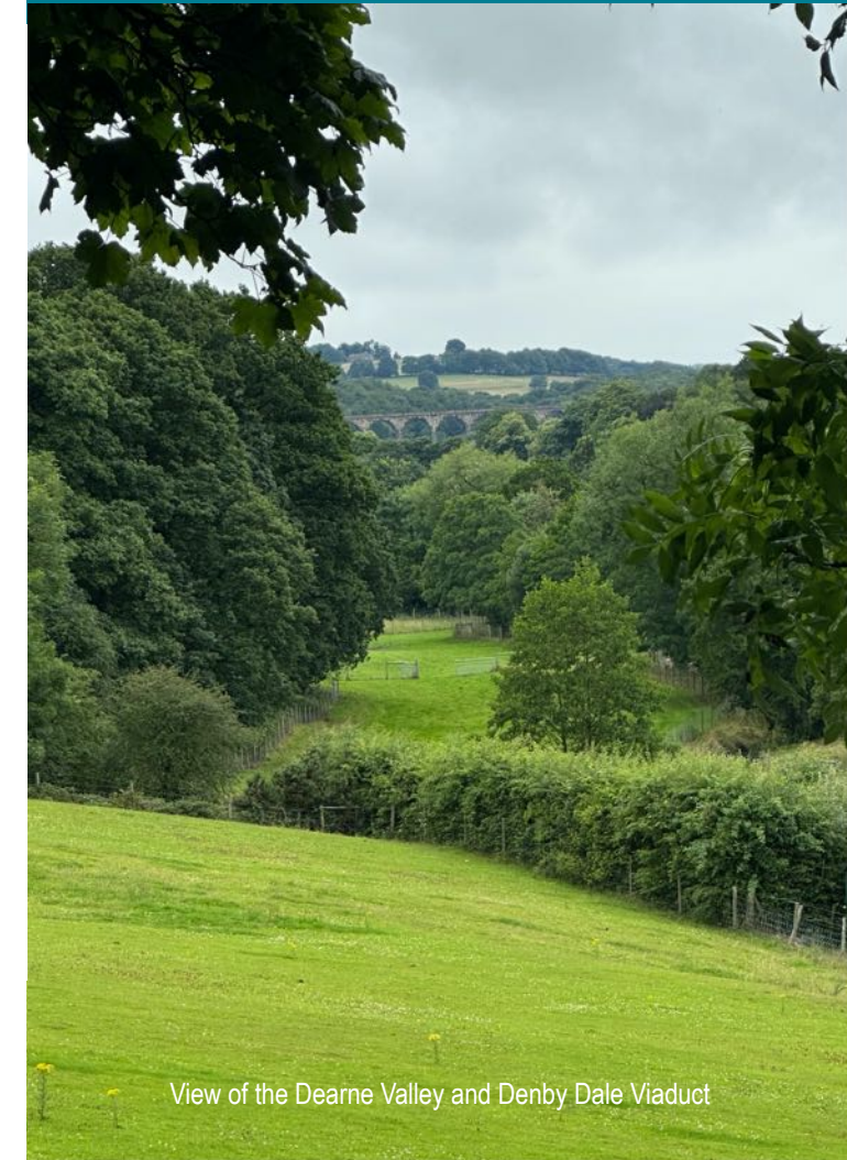
View of the Dearne Valley and Denby Dale Viaduct

The Denby and Cumberworth Trail is a 7 mile circular walk. There are some stiles along the route. Stout footwear is advisable.