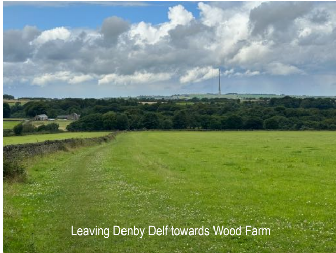
Leaving Denby Delf towards Wood Farm

river and up other bank and continue on path.