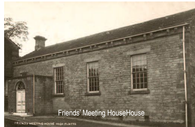
Friends' Meeting House

Turn right off the track to the stone stile just outside the Square Wood Reservoir enclosure. The footpath continues across to the corner of Square Wood. Continue along into wonderful semi-natural grassland with scrub. Eventually you will climb, passing the gate below Strines Lodge, a little further is another gate on your right. Pass through and rejoin the main walk at Point C.