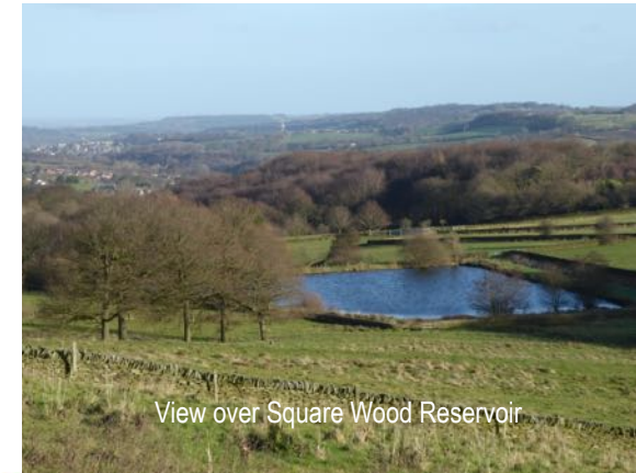
View over Square Wood Reservoir