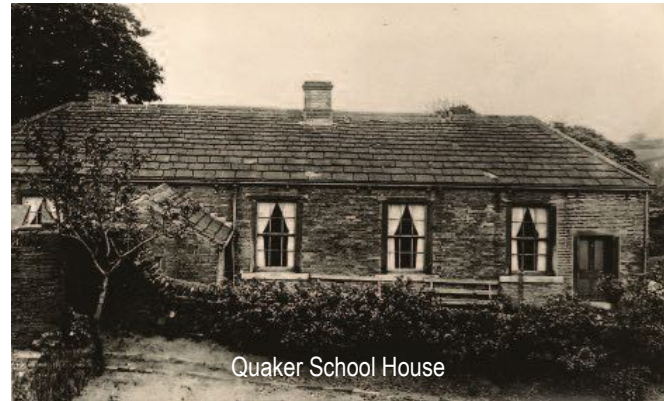
Quaker School House