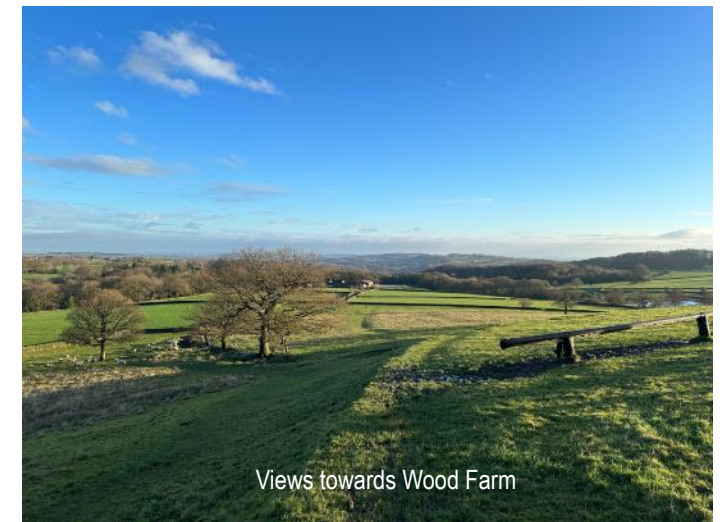
Views towards Wood Farm