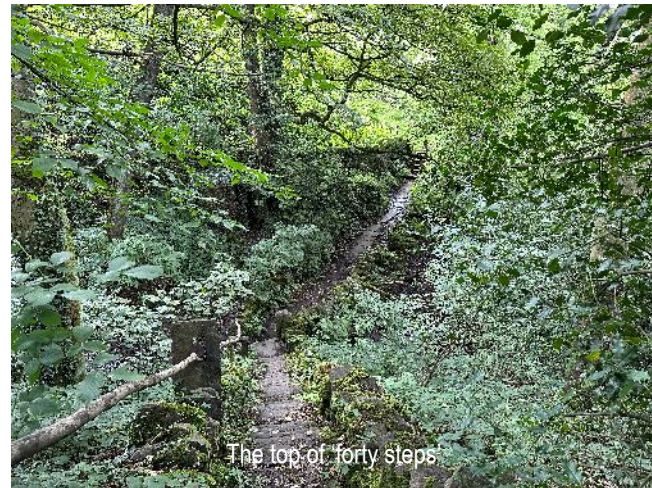
The top of 'forty steps'

Just before the Lodge turn left through a gate and continue along the southern boundary of the Strines garden. Over the next stile turn right again, go over a further stile to the left and descend with care a flagged path and steep 'forty steps' to cross the wooded stream.