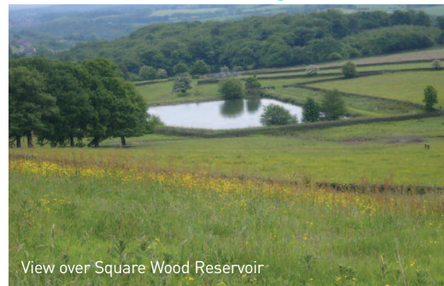
View over Square Wood Reservoir

Buses go to High Flatts from Huddersfield (Service 83, Huddersfield Bus Company – no Sunday service) and to nearby Ingbirchworth and Upper Denby from Penistone (Services 301 and 29, 9 buses per day; 6 on Sundays).