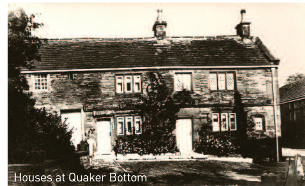
Houses at Quaker Bottom

Here you may continue the Short Walk—or switch to the longer walks. (see below)