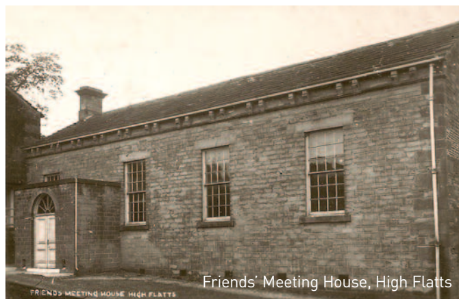
Friends' Meeting House, High Flatts

At the last stile turn right along the drive, between house and garden, and then over further stiles to descend to Strines Lodge. Just before the Lodge turn left over the stile and follow the return route via “forty steps”.