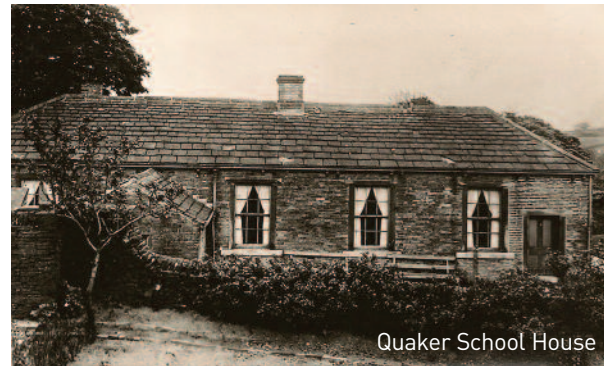
Quaker School House

The small settlement of High Flatts is set in attractive landscape at the head of the Dearne Valley, high on its watershed with the River Don. Its history and present character are intimately intertwined with the story of the community of the Society of Friends at Quaker Bottom. This picturesque cluster of stone buildings, many listed as of special architectural interest, is designated a Conservation Area.