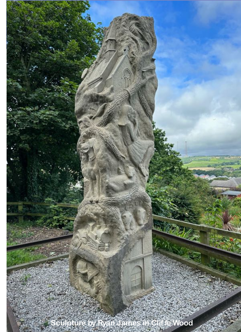
Sculpture by Ryan James in Cliffe Wood

Allow a couple of hours for a leisurely 3 mile stroll around the scenic village of Clayton West. Stout footwear is advisable.